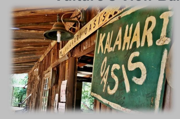
Kalahari Oasis Bush Pub