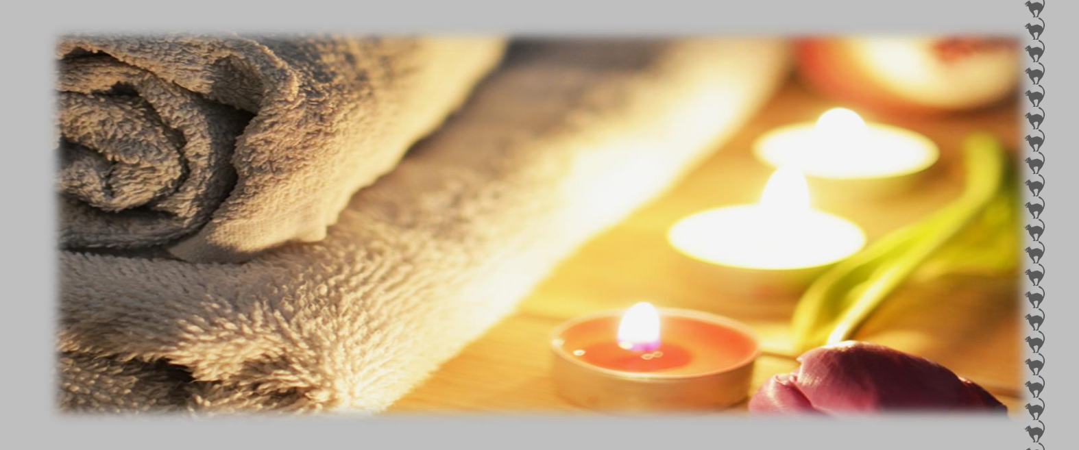
Mbali Day Spa