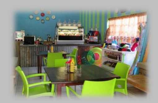
Boeretroos Coffee Shop