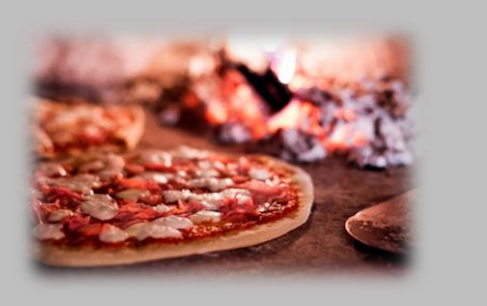
Le Fera Restaurant