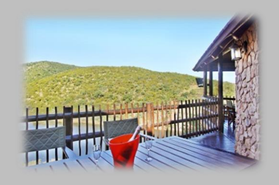
Vulture's View Bar