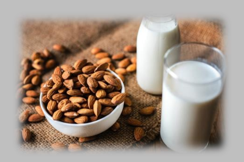
Le Fera Plaaswinkel / Farmshop